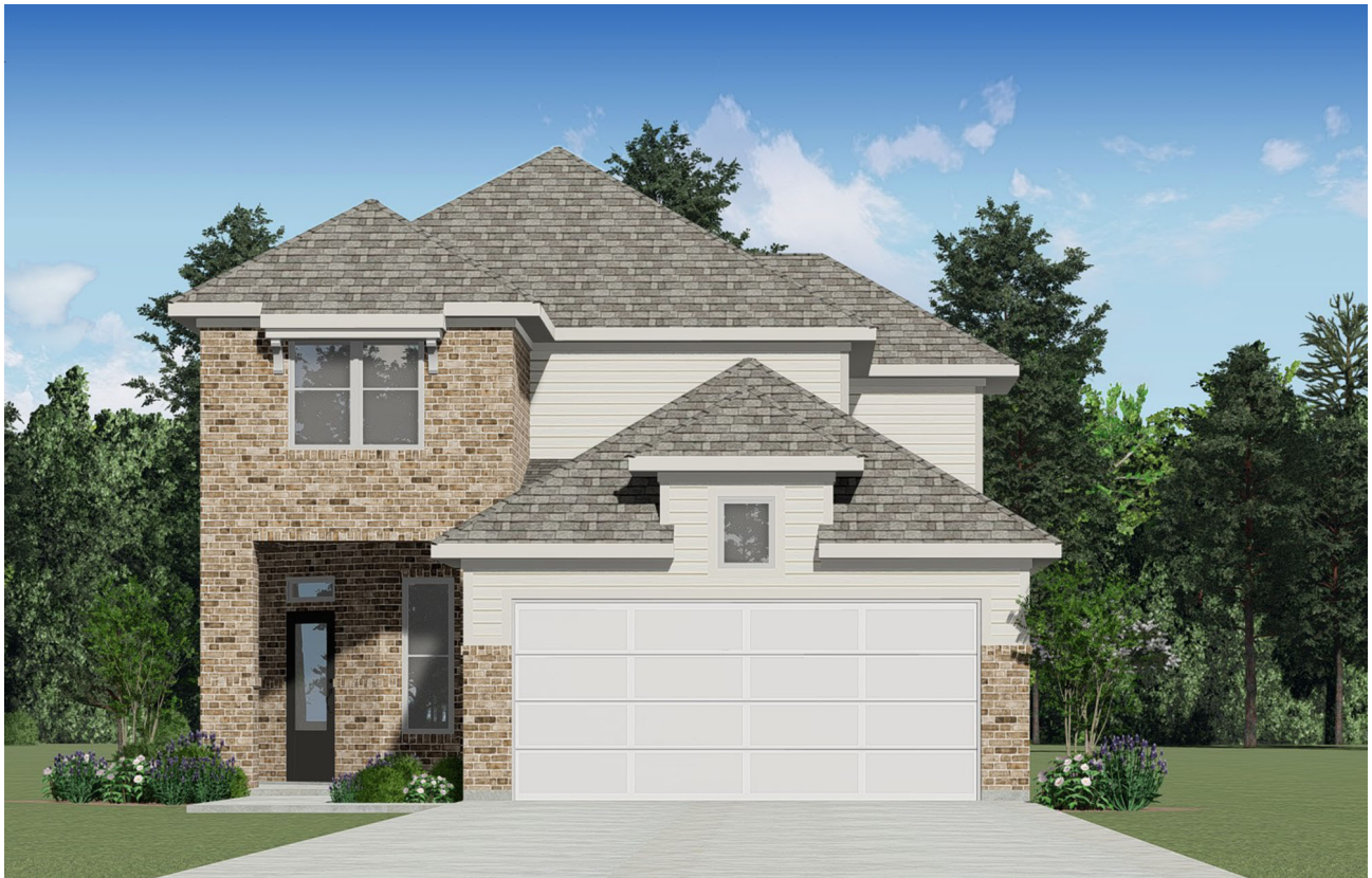
ELEVATION B - 2251 SQ.FT.