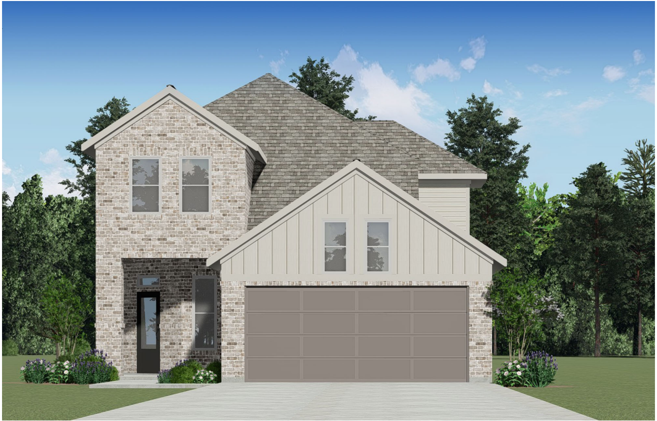
ELEVATION A - 2251 SQ.FT.